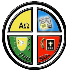
Thusia Seventh Day Adventist Church

You desire lasting pleasure? Learn about your Saviour. He guarantees that your soul would be fully satisfied. He would fill you with His love and joy. Your soul would never lack happiness. Reject the sinful pleasures of this deteriorating world and accept Jesus Christ to make you sin-free right now . Only Christ in your heart would prepare you for the soon-coming destruction. Forsake the carnival riotous behaviour. Don't disqualify yourself from entering heaven. Revelling is named among the "works of the flesh" in Galatians 5:21.